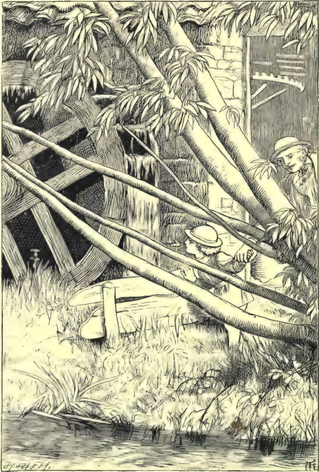
WILLIE IS TAKEN TO SEE A WATER-WHEEL..